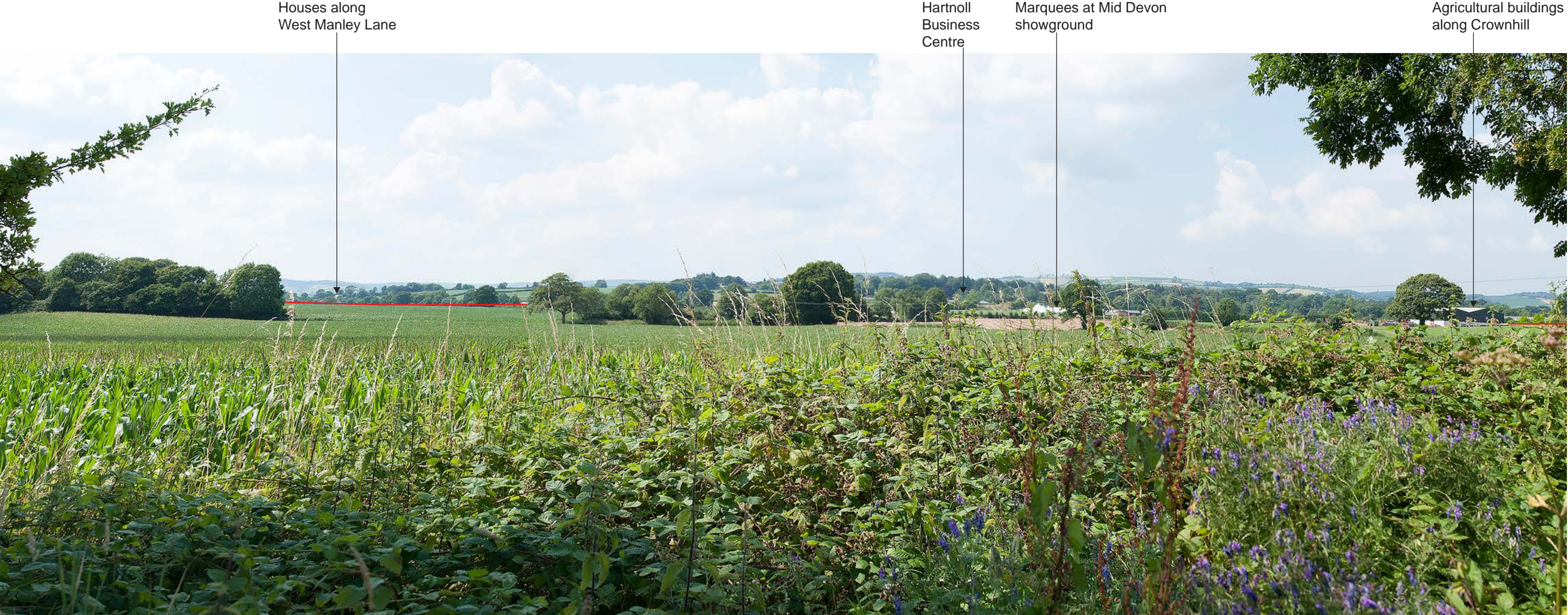
Viewpoint H2: Taken from the Grand Western Canal, along eastern site boundary, looking north-west