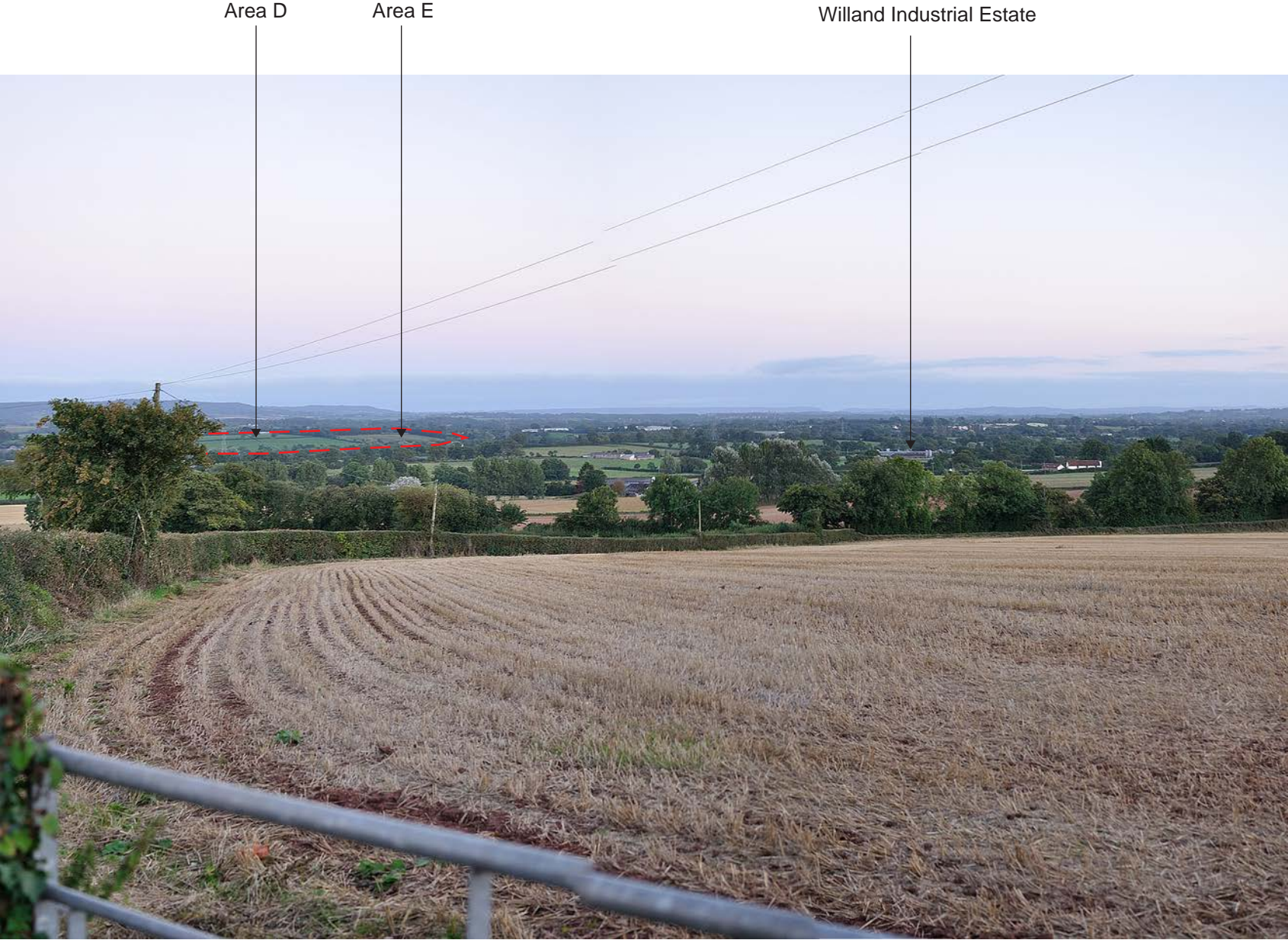
Viewpoint J5: Taken from crossroads on Turnpike, Sampford Peverell, looking south-east