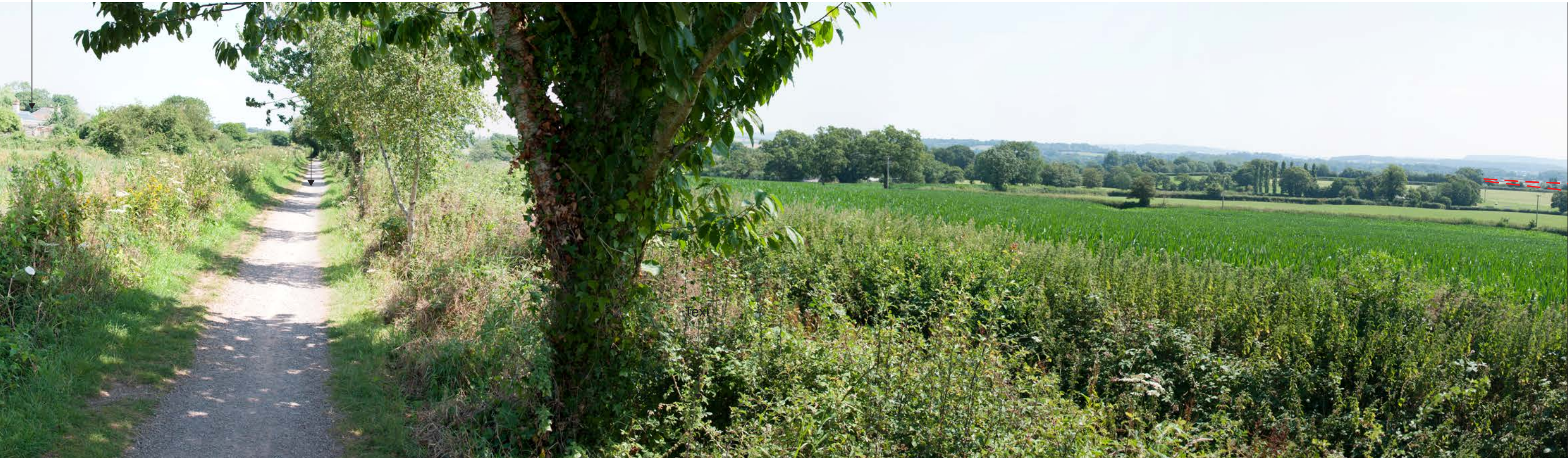
Viewpoint J4: Taken from the Grand Western Canal, looking south-east

Sampford Peverell Grand Western Canal towpath