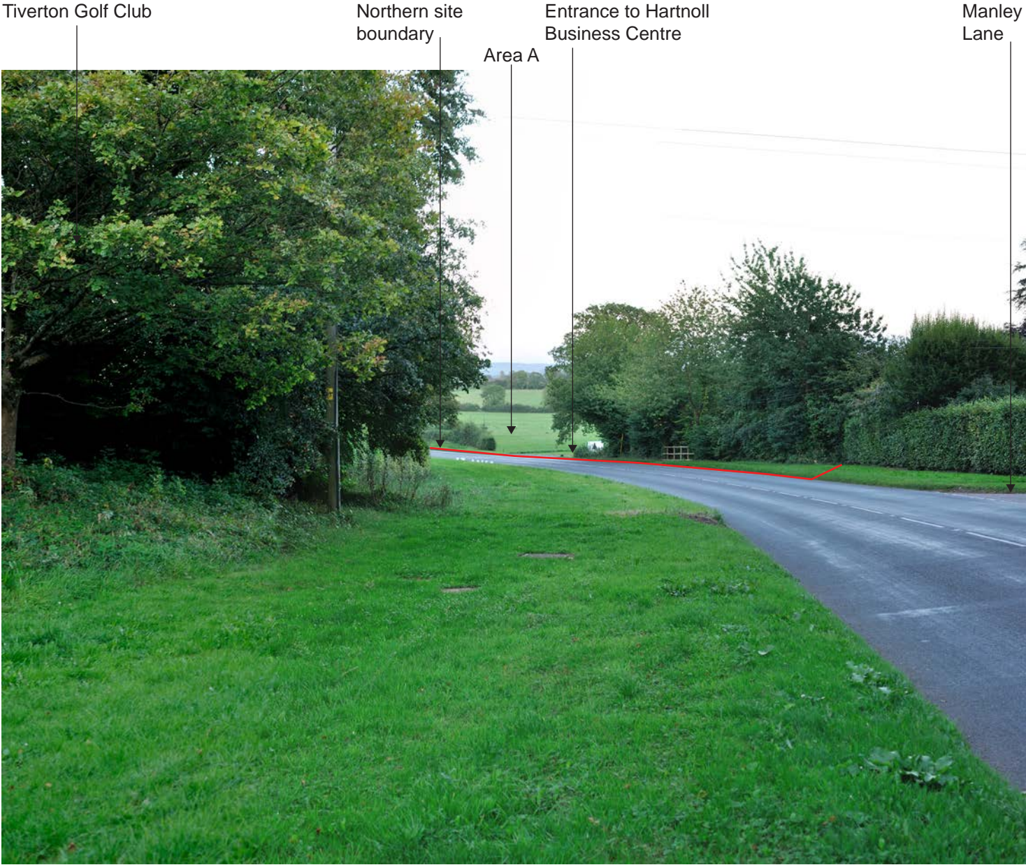
Viewpoint H3: Taken from Post Hill looking east