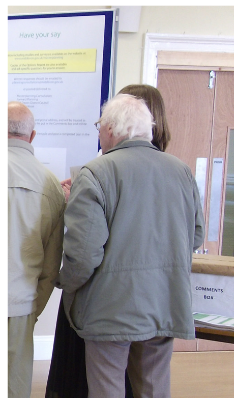
Public exhibition held in Halberton