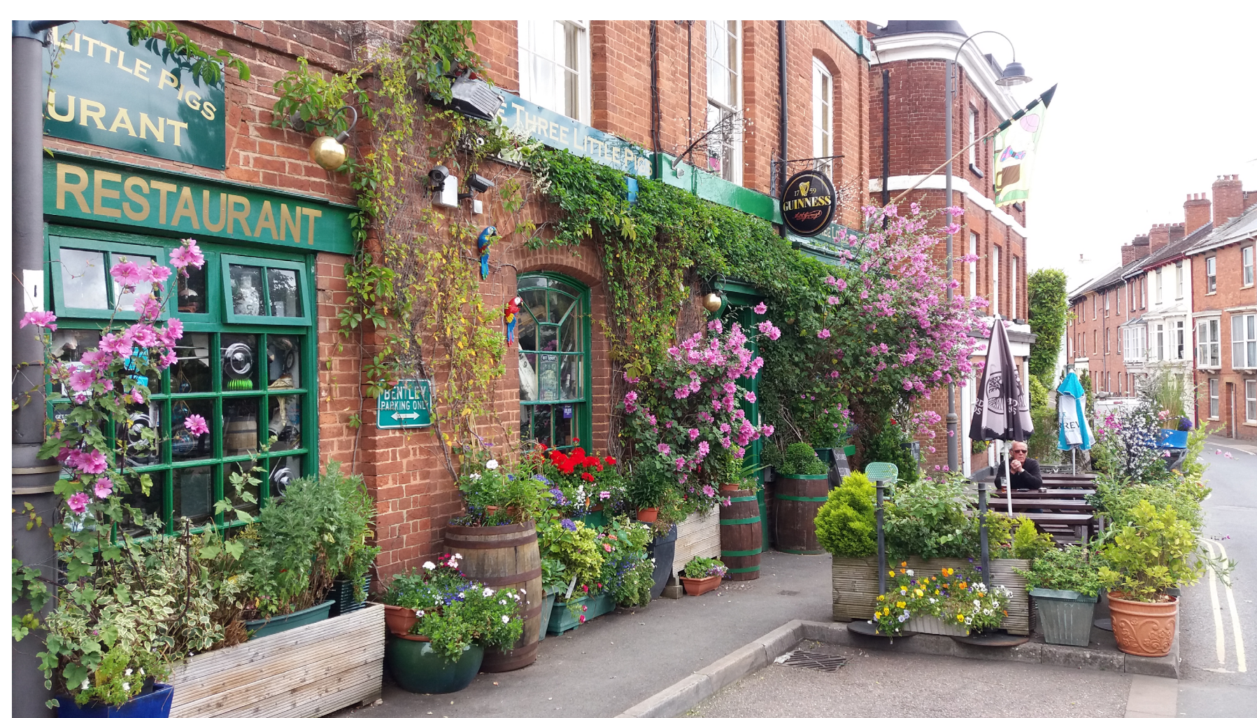
Local business, Crediton

Policy DM23 in the current Local Plan helps prevent the loss of community facilities such as shops, cultural and recreational facilities and other important local services. Plan Mid Devon provides an opportunity to retain this policy and could also identify land within, or adjoining, villages that would be suitable for new community facilities.